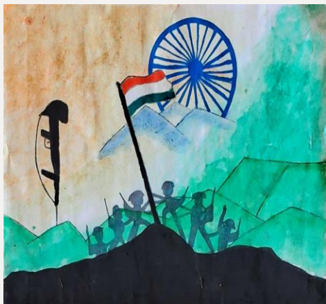
Bhavya Agrawal (VI)