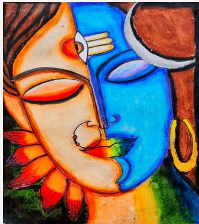
Aadhy Chaturvedi (VI)